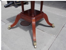
English Regency Mahogany Leather Top Reading Table with Flanking Drawers, Circa 1800